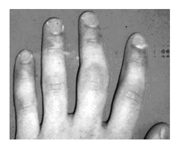
Figure 2 Left hand of 15-year-old male climber who undertook intensive finger strength exercises and ignored medical advice, permanently damaging epiphyseal plate of proximal interphalageal joint in middle finger. Informed consent obtained for publication. (Reproduced from: Hochholzer T, Schöffl V. Epiphyseal fractures of the finger middle joints in young sport climbers. Wilderness Environ Med 2005;16:4–7, with permission from the Wilderness Medical Society).<sup>22</sup>

To minimise the risk of digital damage and injury from uncontrolled falls at international bouldering competitions, the UIAA medical commission recently proposed, and the International Council of Competition Climbing accepted, that there should be a minimum age of 16 years for participation; that competitors should be able to safely fall 3 m onto a DIN 7914 standard (corresponding to 22 kg/m³) ground mattress a minimum of 30 cm thick; and that route-setters do not place handholds at the top of route that require great jumps to achieve. Many competition bouldering climbing teams include