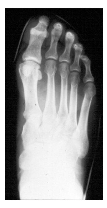
Figure 6 An X-ray of the climber's foot (the same subject as in fig 5) in a climbing shoe. Note "crimping" toes and hallux valgus position of the large toe. Informed consent obtained for publication.