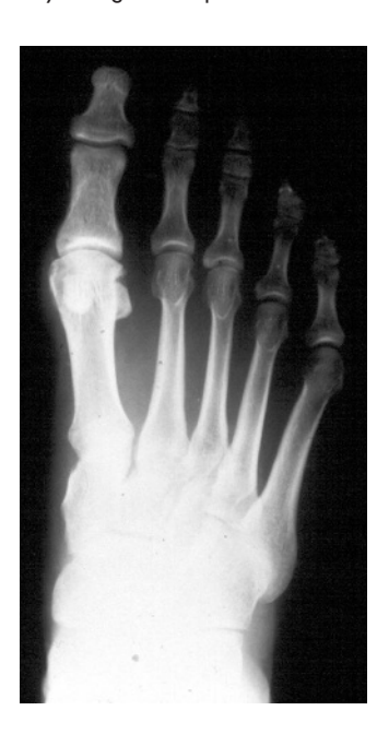
Figure 5 An X-ray of a climber's bare foot while standing. Informed consent obtained for publication.