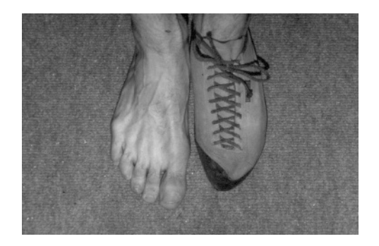
Figure 4 A standing climber's feet bare and wearing climbing shoes. Informed consent obtained for publication.

Climbing shoes should facilitate the ability to stand using friction with straight toes and on edges with bent toes with precision and proper contact. The majority of climbing foot injuries result from wearing climbing shoes that are unnaturally shaped or too small. High-ability climbers experience more foot deformities and injuries compared with climbers of lower ability due to the common practice of wearing climbing shoes sized smaller than normal street wear shoes (see figs 4 to 7). To 77 To 8 Only one paper 77 on young climbers reported shoe sizes for both normal and climbing footwear: the mean was found to be 2.3 \pm 0.73 Continental sizes smaller in 19 junior competition subjects (Volker Rainer Schöffl, personal communication, 2007).