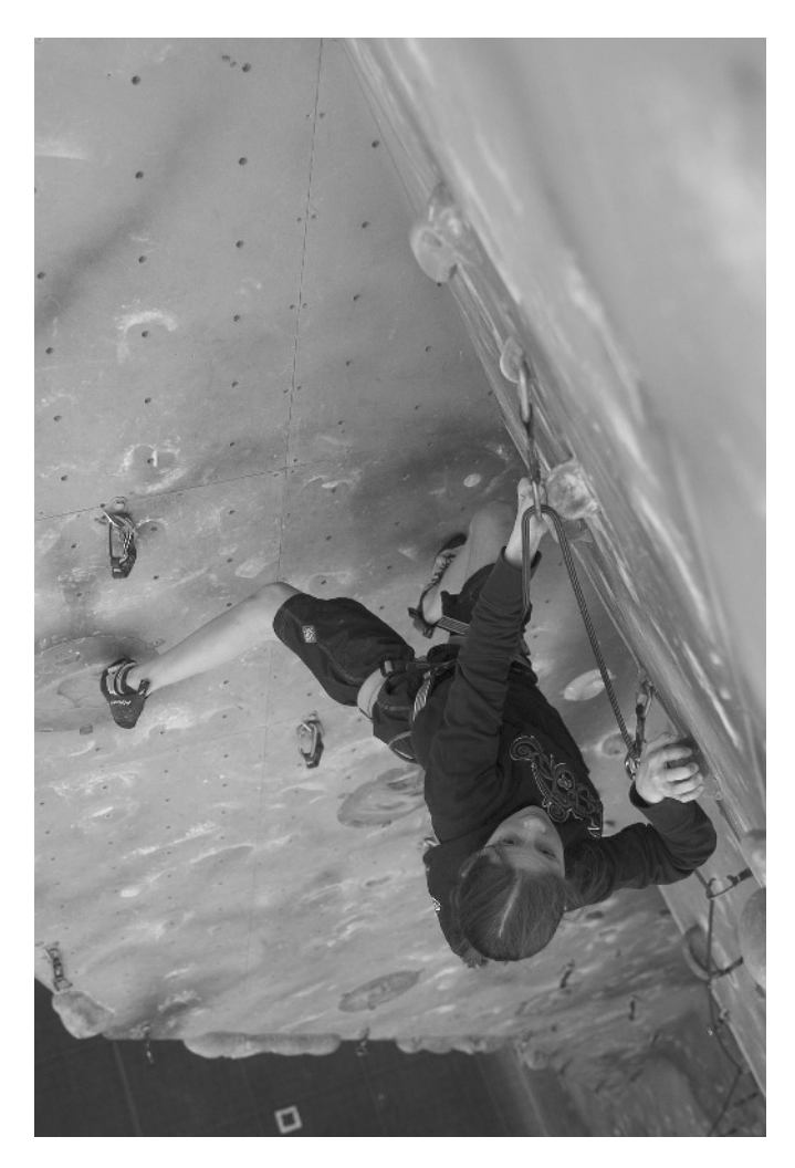
Figure 1 Female competition climber aged 13 years on an indoor lead climbing route. Informed consent was obtained for publication.

growing young climber. The term "youngster" in this review refers to those aged 7–17 years.