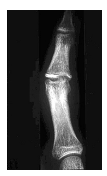
Figure 3 Radiographic image of middle finger from subject in fig 2. Note 15° rotation of interphalangeal joint that resulted from ulnar deviation. Informed consent obtained for publication. (Reproduced from: Hochholzer T, Schöffl V. Epiphyseal fractures of the finger middle joints in young sport climbers. Wilderness Environ Med 2005;16:4–7, with permission from the Wilderness Medical Society).<sup>22</sup>

fall training and ankle stabilisation training, and use "spotters" to limit injuries from inevitable bouldering falls.<sup>21</sup>